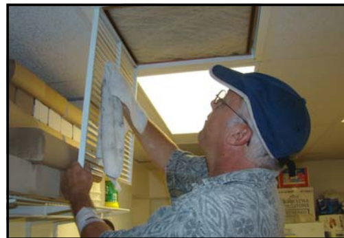
Maintenance is in Our Hands

9:30 a.m.: Members have the opportunity to work the front reception desk and answer a four-line phone system. Work is central to recovery and transformation.