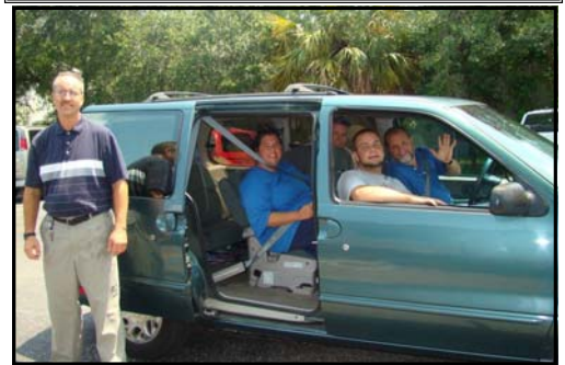
Off to Work!

This Pictorial Essay is dedicated to an anonymous supporter who replied to an ad in our July Gazette, which requested the donation of a digital camera. All of the photos displayed in this edition were taken with our new Sony Cybershot. Thank You!!!