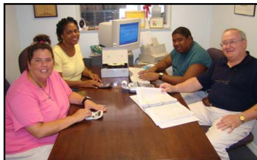
Leisure (Member) Bank is Open!

10:15 a.m.: Upkeep of the Clubhouse is entirely up to members and staff. It's a chance to use our abilities or acquire new skills. Clubhouse is about utilizing strengths and interests.