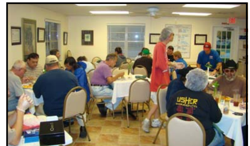
Baked Stuffed Tilapia is Served

3:15 p.m.: Business Unit offers computer work involving attendance, statistics, reports, and database management. Computer savvy members can sharpen their skills while more inexperienced members develop new skills.