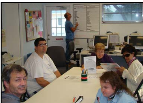
Organizing the Work

8:00 a.m.: The Food Service Unit begins early and offers members and staff a cheese omelette with sausage. It's a steal at $1.25!