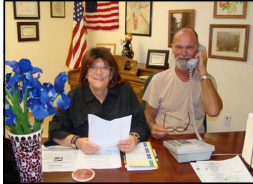
A Smile to Greet You

9:00 a.m.: The Business Unit, one of three units, begins the "work-ordered day" with a unit meeting. Here work is organized and members volunteer for tasks and duties.