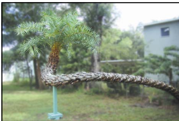
When Vincent House first relocated in 2005, the clearing of Brazilian pepper trees from the backyard exposed a determined and resilient palm tree. It has since become a symbol for our members and staff.