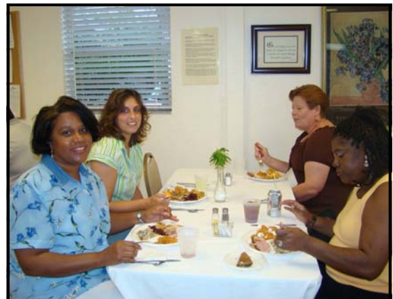
We were joined by members, staff, families and friends. It was an opportunity for thanks, good food and plenty of happiness.