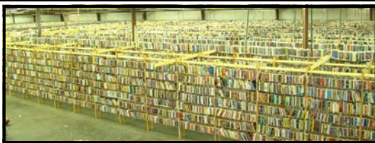
Seashell Books of Clearwater, FL, is one of the 25 largest booksellers in the world