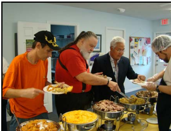
For Thanksgiving we offered an exquisite buffet, complete with all the fixings. Together, we prepared, served and enjoyed a delicious meal.